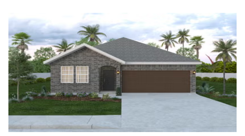
Marigold From $230,990 1,899 sqft • 3 bedrooms • 2 baths 1.0 story • 2 car garage