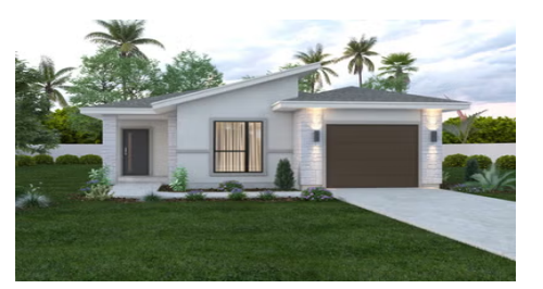
Presidio From $209,990 1,471 sqft • 3 bedrooms • 2 baths 1.0 story • 1 car garage